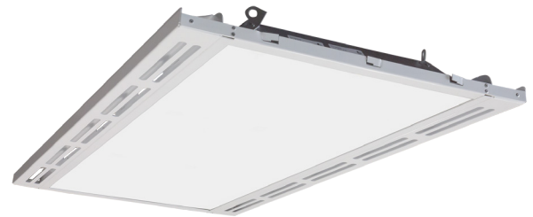
OL4 Series 2x4 Vented Plenum

Applications include: Office and Retail Spaces.